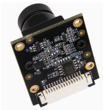
500MP MIPI Camera