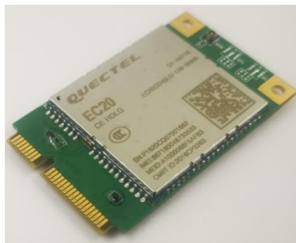
4G Module For imx8m mini series Board