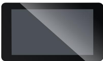
7 Inch MIPI Display for imx8m mini