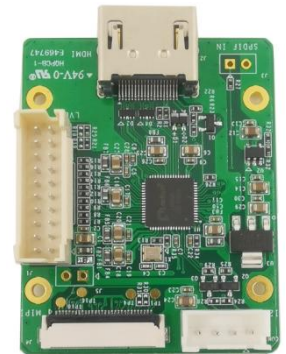
MIPI To HDMI Adapter Board