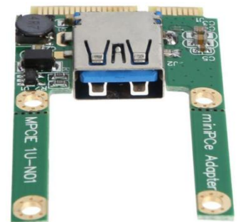
PCIe To USB3.0